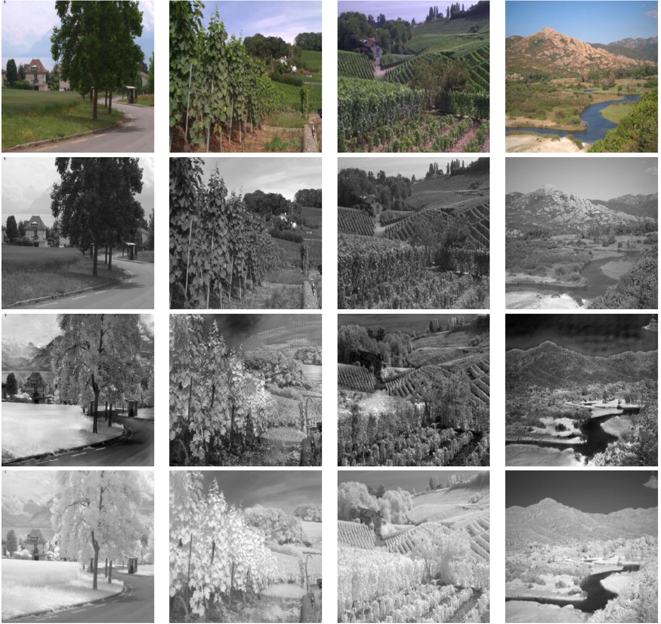
Figure 2. Illustration of NIR images obtained by the proposed CycleGAN, which are later on used to estimate the corresponding NDVI indexes. (1st.row) RGB images. (2nd.row) Gray scale image used as input into the CycleGAN. (3rd.row) Estimated NIR images. (4th.row) Ground truth NIR images. Images from [3], country , field and mountain categories.