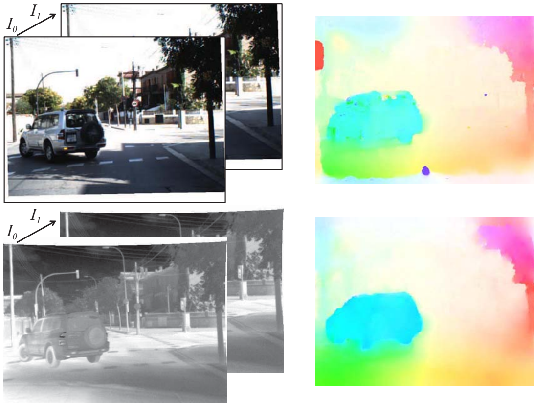
Figure 2: (left) Two pairs of cross-spectral images (VS and LWIR). (right) Dense flow fields used for the correspondence search.

similar result. Another problem to be considered for future work is the lack of ground truth disparity value, although we expect to use the Bumblebee camera (at the left side in our stereo rig, see Fig. 1) temporal synchronization problems need to be solved first (Bumblebee work up to 15fps).